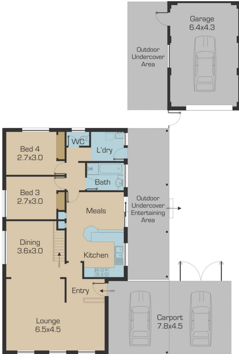
↑ Ground Floor

Disclaimer: Please note floor plans are indicative only not drawn to exact scale. All dimensions are approximate. Potential buyers should view the property in person.