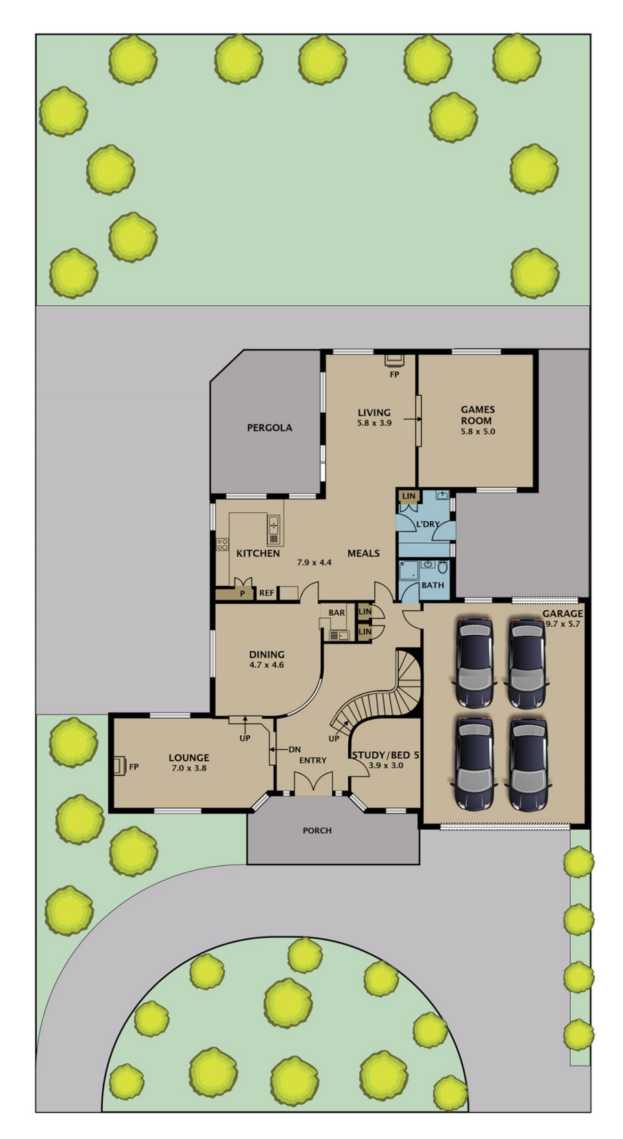
Disclaimer. Please note plans are indicative only and not drawn to exact scale. All dimensions are approximate. Potential buyers view the property in person.