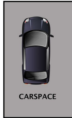
CARSPACE (NOT IN POSITION)

Disclaimer. Please note plans are indicative only and not drawn to exact scale. All dimensions are approximate. Potential buyers view the property in person.